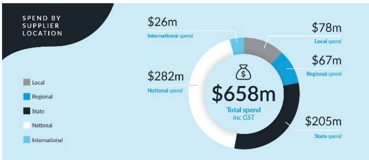
Figure 2 - Profile of expenditure by supplier location