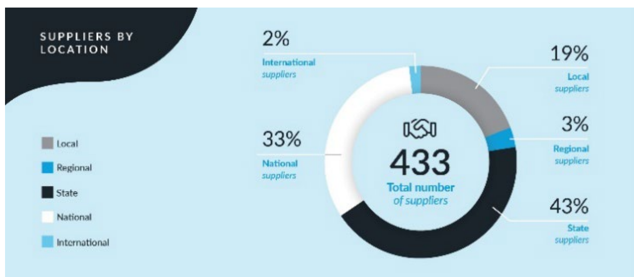
Figure 1 - Profile of suppliers by location